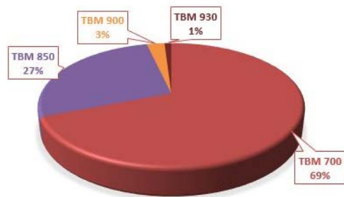
TBM FLEET FLIGHT HOURS