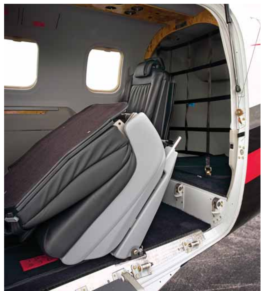
The club-style passenger area (top) has been changed slightly to give more shoulder room, and a single storage cabinet is now standard. A second cabinet with a CD player is a $5,600 option. Aft seats (above) fold forward for loading the aft baggage compartment.