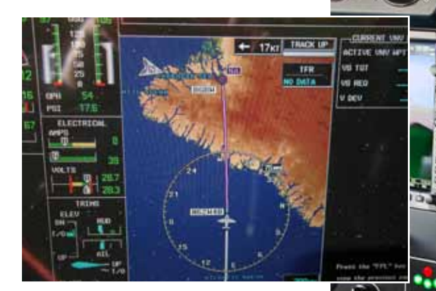
An MFD map shows SN600-N600YR-on its way to Narsarssuaq, Greenland (above).

The leg to the Narsarssuaq, Greenland, airport (BGBW) was just 670 nm, which the ship ate up in two hours, 25 minutes. Once again, we flew at FL280, burned 55 gph, and now saw 297 KTAS in the -50 degree Celsius (ISA -10 degrees at that altitude) outside air temperatures. By the way, it's easy to set power. For climbs in the 850-horsepower mode a white diamond appears on the torque gauge; move the power lever so as to line up the pointer with the diamond and you have the recommended climb power setting. Similarly, in cruise a white box appears on the torquemeter's arc.