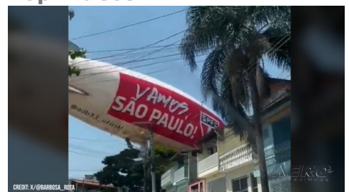
Airborne 09.30.24: Blimp Down!, Lawyer v Blackhawk, Young Eagles Update