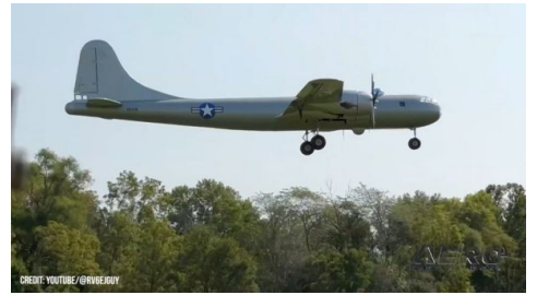
Airborne Affordable Flyers 09.26.24: EXP B29!, EAA v FAA, Affordable Flyer Expo