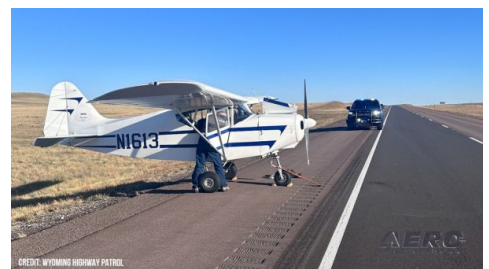
Airborne 09.27.24: Highway Ldg and Departure, PAL-V Progress, Dustoff Honors